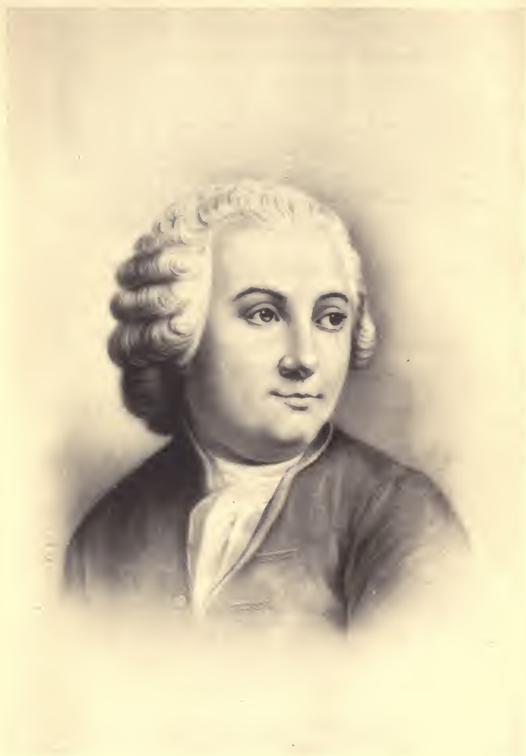
ÉTIENNE BONNOT DE CONDILLAC.